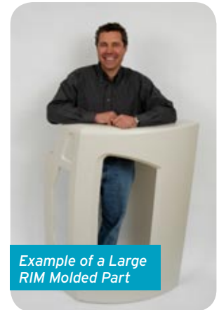
Example of a Large RIM Molded Part

OTHER DESIGN CONSIDERATIONS: While RIM is the more cost-effective option for low volumes, structural foam molding can be used for jobs with higher quantities where higher tooling costs are offset by lower part costs. Neither process is the best for production of high volumes.