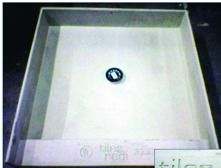
Exothermic molding, Inc. through the RIM process provided strong one piece modules, ready for ceramic tile or marble.

Three other sizes, a 37" x 37" corner unit, a 37" x 48" and 33" x 60", are under development.