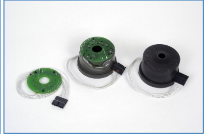
Figure 1A 1/4" aluminum plate and a steel alloy strap are molded into a single part, as shown above. Encapsulation using RIM was chosen for two different applications on one product manufactured by Kendro Laboratory Products. Above (right), sophisticated electronics are encapsulated to protect against damage.

Variable wall thicknesses of .062" - 1", produced from high density self-skinning foam, allowed for important design freedoms. Low cost, fabricated aluminum molds were used and finishing included painting and threaded brass inserts.