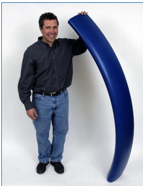
Large part sizes with complex geometry are a perfect fit for the RIM process.

When two large regional banks merged and management decided to re-brand the 2,300 new branches, Exothermic Molding was chosen as a key supplier and Reaction Injection Molding the preferred process. The focal points of the new branches, designed by a well-known Brand Management Design Firm, was to be a large branded kiosk used for Financial Merchandising and an Express Deposit Box. The sizable displays, approximately 7 feet wide by 7 feet high, posed many design and manufacturing challenges.