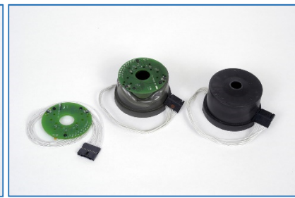
Figure 1A 1/4" aluminum plate and a steel alloy strap are molded into a single part, as shown above. Encapsulation using RIM was chosen for two different applications on one product manufactured by Kendro Laboratory Products. Above (right), sophisticated electronics are encapsulated to protect against damage.

Variable wall thicknesses of .062" - 1", produced from high density self-skinning foam, allowed for important design freedoms. Low cost, fabricated aluminum molds were used and finishing included painting and threaded brass inserts.